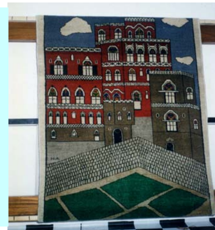
A sample of hand-made carpet.

organizations. In this day workshop held in Aden.