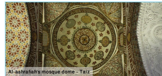
Al-ashrafiah's mosque dome - Taiz