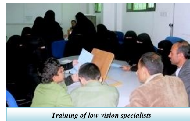
Training of low-vision specialists

In addition, a workshop was implemented, aiming to review the draft Reference Trainee Manual concerning the early detection of disability. Attendees included pediatricians and Pediatrics Sections Heads at universities and hospitals of the Capital City and Taiz, Ibb and Dhamar governorates. It is worth mentioning that, following the Manual approval, it will be applied with health workers in healthcare centers.