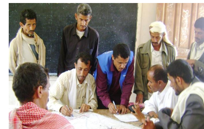
Local Authority members during training (Al-Misrakh, Taiz)

Accordingly, during the quarter, 39 male and 30 female consultants were trained on the Empowerment Manual in SFD's Hajjah Branch Office (BO). In Ibb BO the development plan of Al-Oudain was prepared with the participation of 45 members of the local authority in the district and also the sub-districts' coordinators. About 40 local authority members in Al-She'er District were also trained on the same manual. Similarly, 45 male and 26 female consultants were trained on the Empowerment Manual. In Taiz training was conducted on the preparation of the development report for Al-Mawaset district with the participation of 25 members of the local authority (males & females) including the executive organs and the administrative committee. Also a motivation workshop for 15 consultants (males & females) was conducted in subjects related to the training of development committees, as well as an experience sharing workshop for the sub-districts' coordinators and 32 coordinators from Al-Mawaset and Shara'ab Al-Rawna Districts. On the other hand, onsite training was provided for 22 development committees' members in Shara'ab Al-Rawna District (238 male and 204 female) in various development subjects.