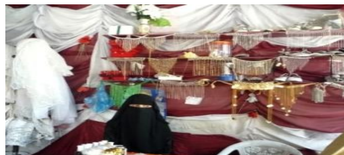
A client for Nama Microfinance Program- Sana'a City

Following the technical training needs assessment carried out by YMN in 2010, the network carried out a further technical training needs assessment study in December 2011. YMN also carried out the Microfinance Awareness Campaign to increase awareness on microfinance so that the largest number of beneficiaries gains access. This was implemented through certain activities such as a number of marketing tools (newspapers, TV and radio advertisements and large banners, brochures, microfinance awareness tents, distribution of promotion materials and workshops and seminars).