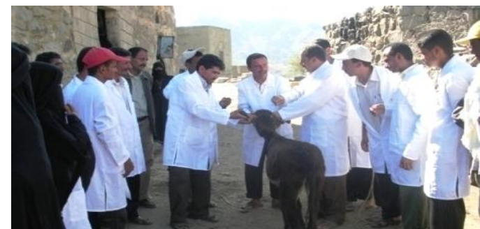
Field training for producer groups in Khairan Al-Muharraq, Hajjah

In December, a series of workshops were held to exchange field experience in project designing and implementation. The workshops, targeting SFD Main Office and Aden BO consultants and project officers, were based on the outputs of field follow-up visits to some watershed rehabilitation projects.