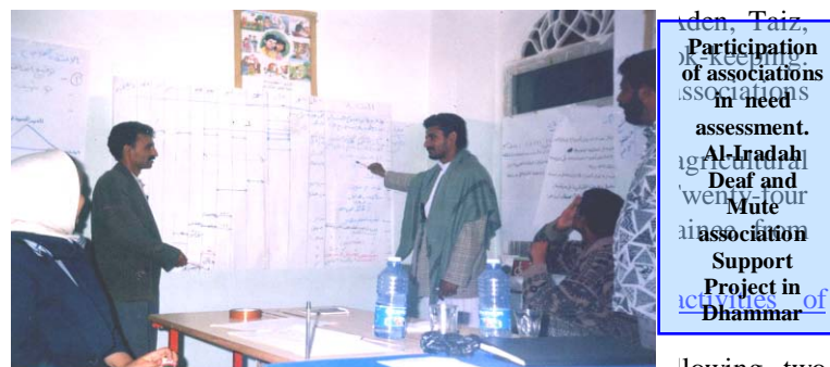
Participation of associations in need assessment. Al-Iradah Deaf and Mute association Support Project in Dhammar

Following two organizations with equipment and furniture to ( in addition to refurbishment and repairs for Amran Center ) to help them improve the services they offer to beneficiaries in local communities: