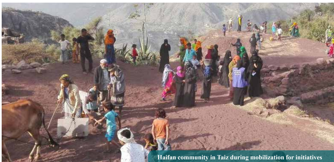
Haifan community in Taiz during mobilization for initiatives