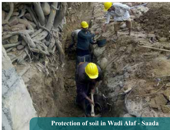
Protection of soil in Wadi Alaf - Saada

The database of savings and lending groups has been updated with a view to excluding the completed groups of grants awarded by the project. The number of active groups reached 113 including a total of 3,334 members (both sexes). A total YER of 33.3 million is to be disbursed to these groups.