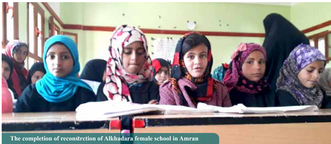
The completion of reconstruction of Alkhadara female school in Amran