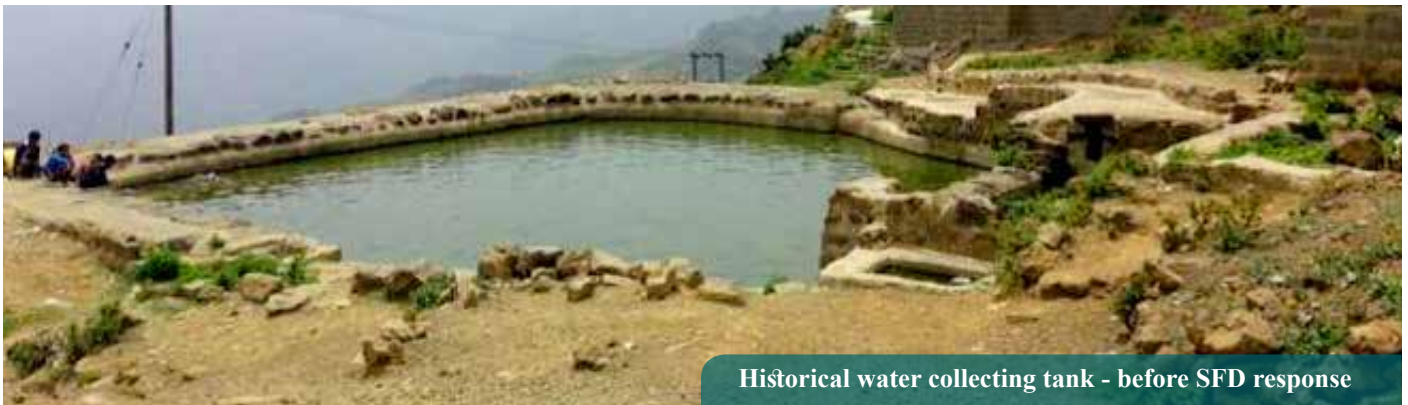
Historical water collecting tank - before SFD response

During this period, 2,263 job opportunities were provided, of which 62 were for the displaced and 10 for females. The number of workers employed during the quarter was 85 workers from 30 skilled workers (builders, contractors, engineers).