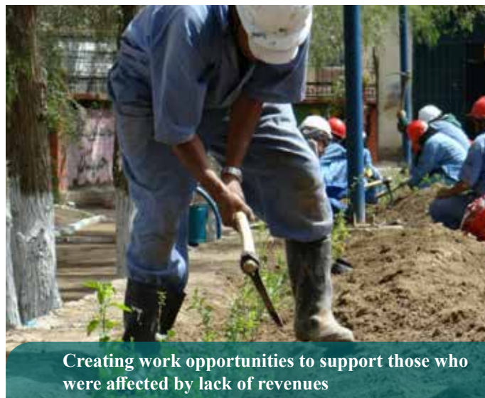
Creating work opportunities to support those who were affected by lack of revenues

The cumulative number of benefiting households exceeds 297 thousand.