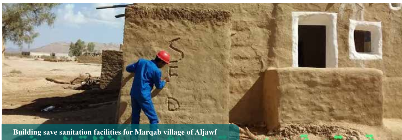
Building safe sanitation facilities for Marqab village of Aljawf