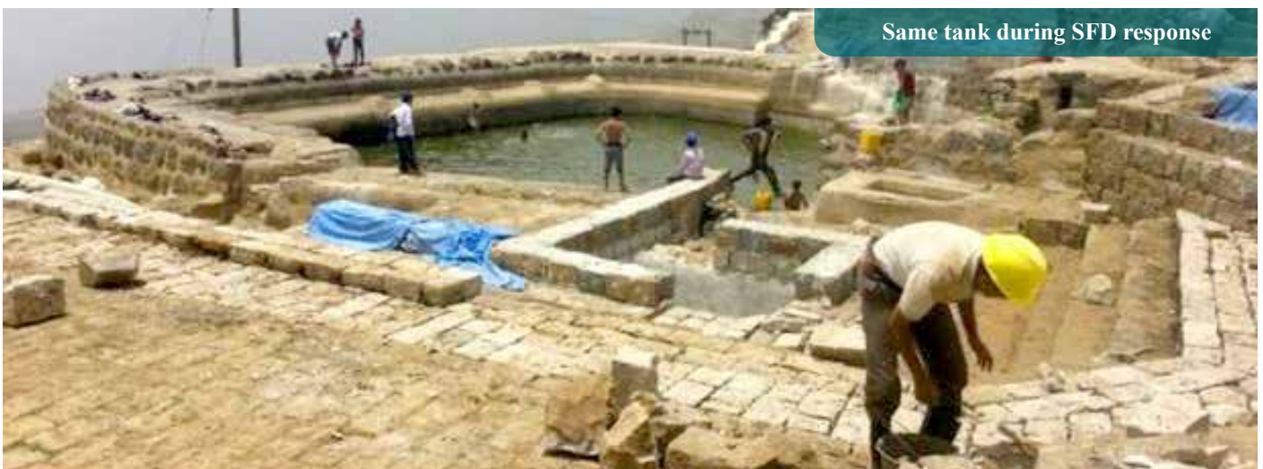
Same tank during SFD response