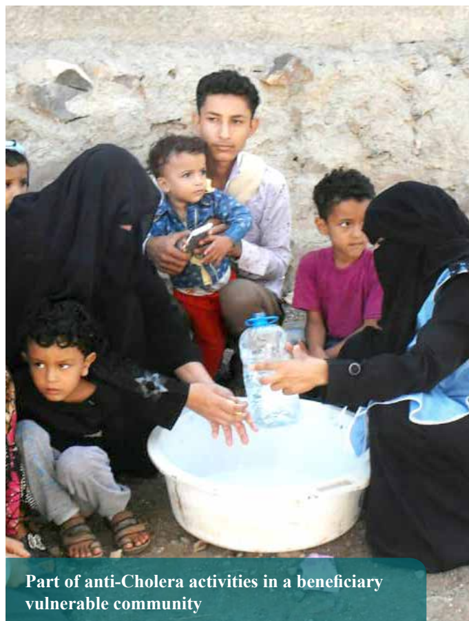
Part of anti-Cholera activities in a beneficiary vulnerable community