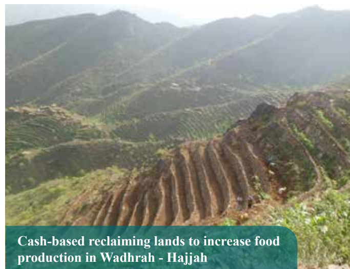
Cash-based reclaiming lands to increase food production in Wadhrah - Hajjah

The savings and lending program began distributing financial grants in Al-Mahweet district (Al-Mahawweet Governorate). The grants are planned to be distributed in the rest of the groups across the targeted districts of Sana'a, Al-Mahweet, Hajjah, Al-Hodeidah and Lahj Governorates.