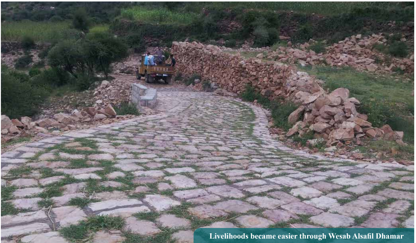
Livelihoods became easier through Wesab Alsafil Dhamar