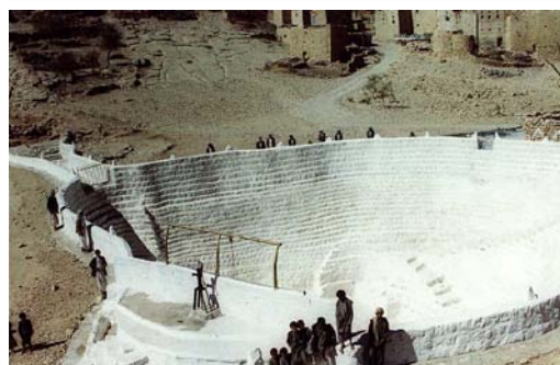
Cistern made of Kadhadh, a traditional construction material.

* A training of trainers course in hygiene and environmental awareness for water harvesting projects was conducted. Twenty trainers (10 men and 10 women) attended the course in addition to seven project officers. The trainers will later work as teams consisting of one female and one male trainer working with health workers selected from the local communities.