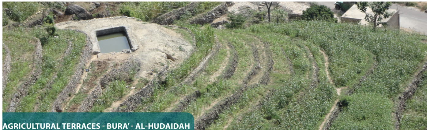
AGRICULTURAL TERRACES - BURA' - AL-HUDAIDAH

16 projects were approved at an estimated cost of approximately $3.3 million, benefiting directly about 13 thousand people (of whom 51% female), and generating temporary employment of approximately 85 thousand workdays. This brings the cumulative total number of projects to 309 projects at an estimated cost exceeding $26.5 million, directly benefiting approximately 306 thousand people (44% female), resulting in more than 687 thousand temporary jobs.