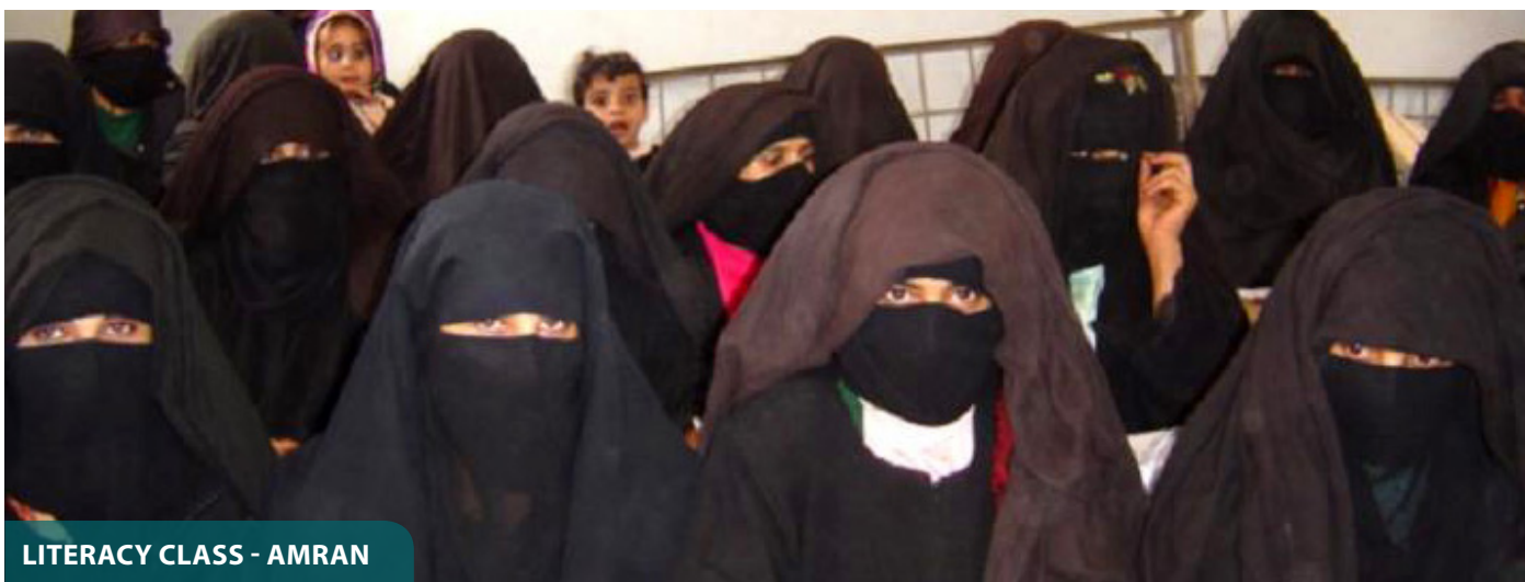
LITERACY CLASS - AMRAN

A workshop was held on March 9, 2013 in the Capital City to discuss the terms of reference (ToR) of the educational and administrative staff of Abdel Nasser Exemplary Secondary School, with a number of participants from MoE's sectors and offices and other officials attending. The approved ToR were later announced for competitor application. Also, furnishing and equipping of the school were completed. On the other hand, civil works continued for establishing the Capital-City-based Early Childhood Development Center.