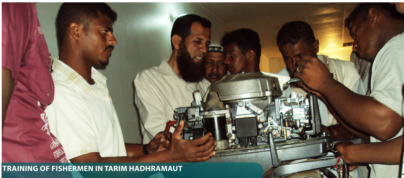
TRAINING OF FISHERMEN IN TARIM HADHRAUT

YMN conducted a workshop titled (Rural and Agricultural Finance "RAF") on January 30th 2013, with 24 participants from various MFIs in Sana'a and the World bank, European Union, GIZ and Islamic Relief attending. During the workshop, the RAF status in Yemen and the obstacles hurdling potential RAF expansion were discussed. YMN also conducted in February 2013 a training course on Effective Communication Skills and Dealing with Customers attended by 23 participants from various MFIs as well as another course on Promotion Methods and Sale Skills in a Competitive Environment attended by 22 participants (8 females) from YMN's member MFIs. Similarly, YMN conducted a workshop on Corporate Governance in cooperation with the International Finance Corporation (IFC). The workshop, attended by 24 trainees (10 female), targeted MFIs' Boards of Directors to ensure more effective and influencing role of the latter. In March, YMN held (in cooperation with Sanabel) a training course on Financial Analysis using the SEEP FAF, with 24 participants from various organizations including from Jordanian MFIs attending, as well as another course on The Art of Effective Negotiation, which was attended by 24 male and 9 female participants. The course, targeting various MFIs, focused on the theoretical and practical aspects of negotiation art skills.