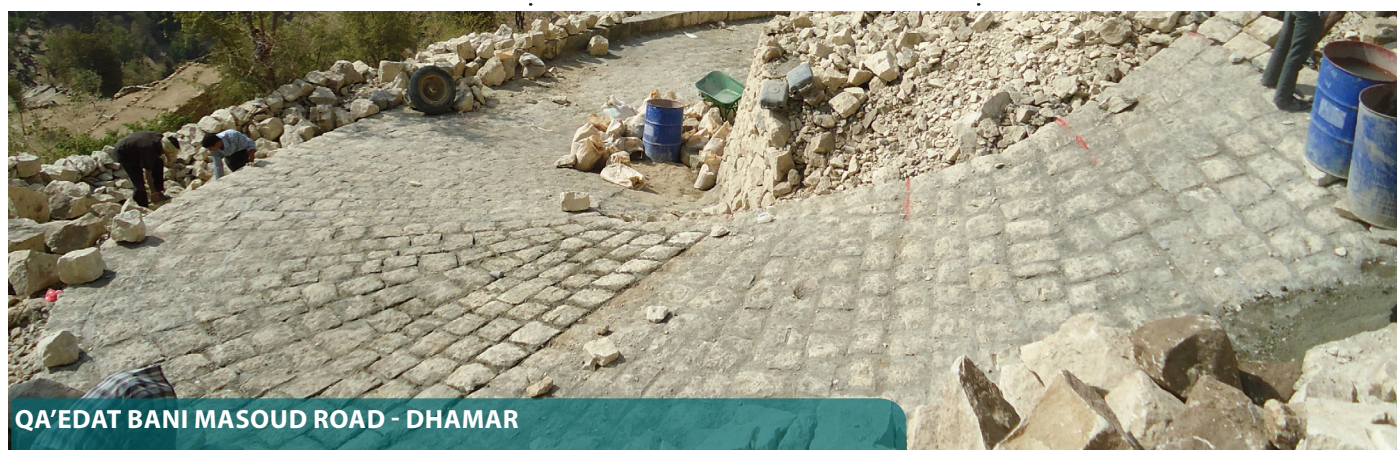
QA'EDAT BANI MASOUD ROAD - DHAMAR