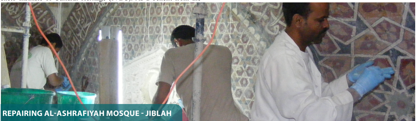
REPAIRING AL-ASHRAFIYAH MOSQUE - JIBLAH

The new trainees who began their training courses have been involved on the dry cleaning works to be eventually added to the local team.