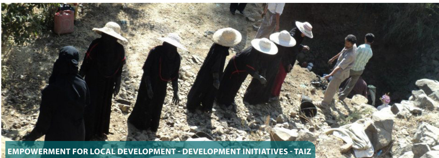
EMPOWERMENT FOR LOCAL DEVELOPMENT - DEVELOPMENT INITIATIVES - TAIZ

At the Community Level: Activities comprised of formation, training and onsite empowerment for development committees in various sub-districts in the two districts of Malhan (Al-Mahweet) and Jabal Al-Shark (Dhamar). This is beside training representatives (m, f) on analyzing the development situation for the sub-districts as well as field visits for the same purpose to the sub-districts of Manakha (Sana'a) and Same' (Taiz), and stimulation of self-help initiatives , training and formation of village councils in the villages of the districts of Al-Tial (Sana'a), Al-Maqatera (Lahj), Same' (Taiz) , Al-Qatn (Hadhramaut), Mukairas (Al-Baidha), Mazher (Raimah) and Al-Sawda (Amran).