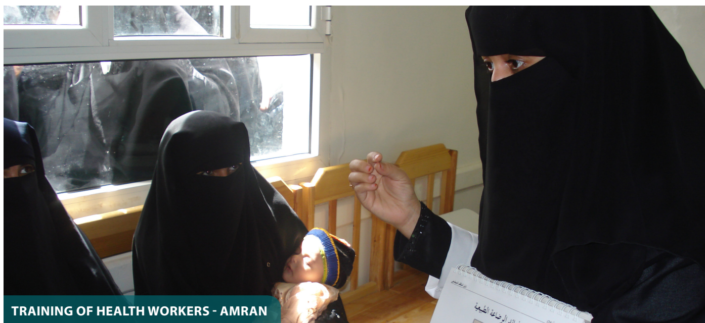
TRAINING OF HEALTH WORKERS - AMRAN

Increasing the number of PHC providers and improving the services The Higher Institute of Health Sciences was awarded to implement the project of qualifying female high-school graduate students to nurses (Amran), with the contract signed and implementation initiated.