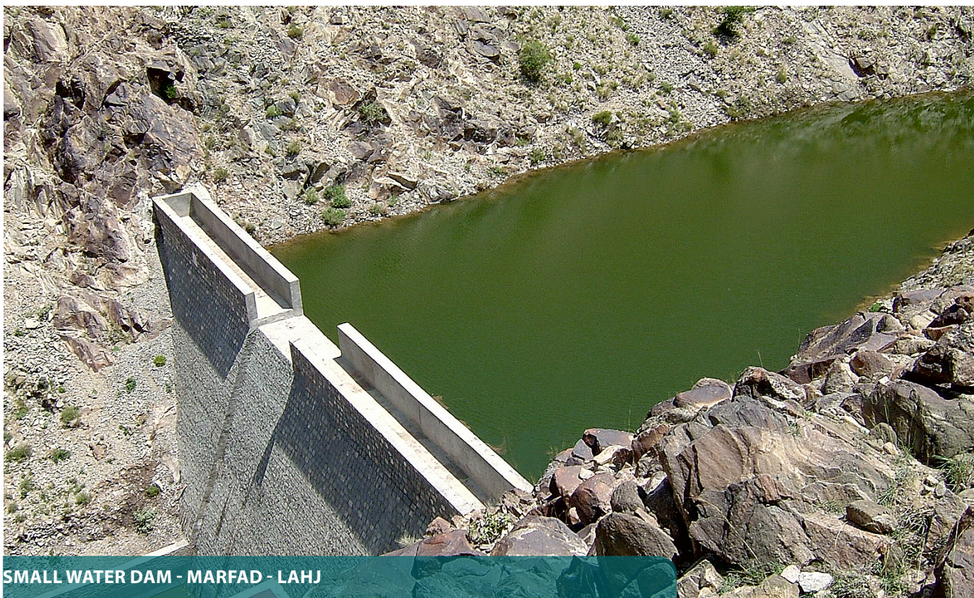
SMALL WATER DAM - MARFAD - LAHJ

In Shibam City/Hadhramaut infrastructure project, cumulative achievement amounts to 61.5%.