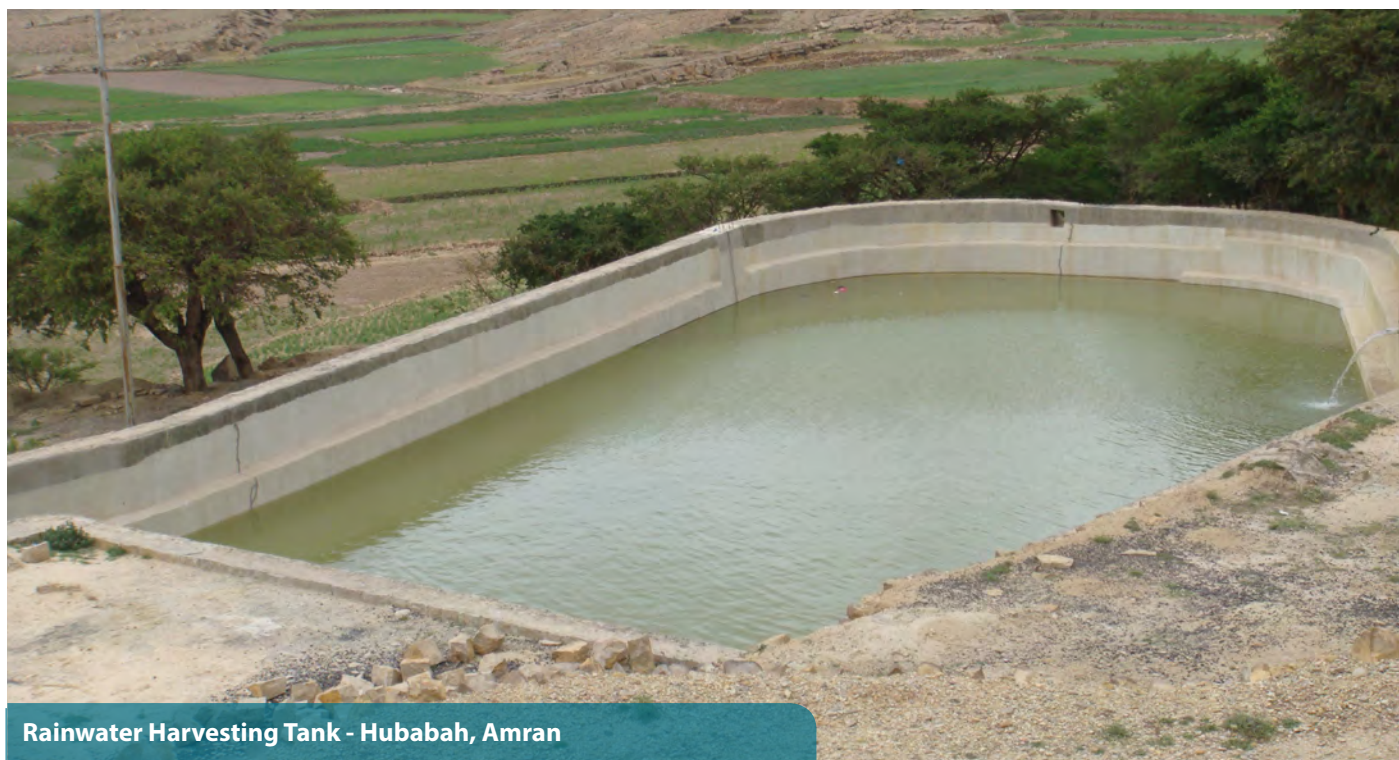
Rainwater Harvesting Tank - Hubabah, Amran

In Shibam City/Hadhramaut infrastructure project, which includes provision of new services, all underground, the cumulative achievement amounts to 69.7%.