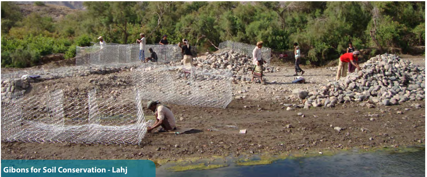
Gibons for Soil Conservation - Lahj

Field Follow-Up: Seven under-implementation projects were visited to assess project implementation quality and targeting, which brings the total cumulative projects visited to 375.