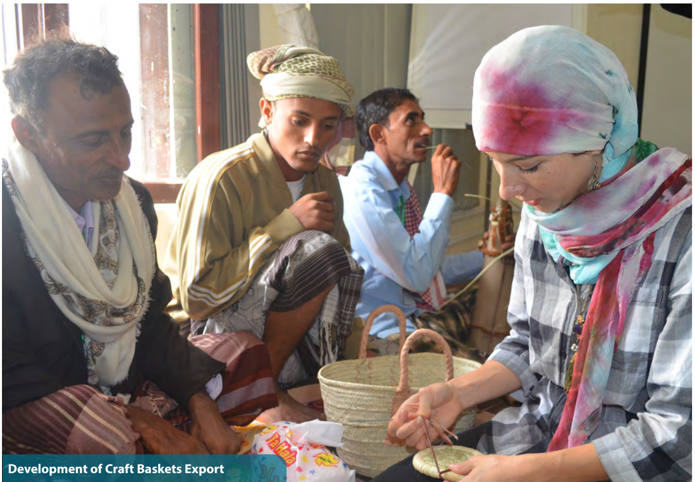
Development of Craft Baskets Export

Protection of MF Clients: YMN carried out during 24–27 November training courses for its members in Aden City, attended by 21 trainees in order to introduce the principles of the protection of customers.