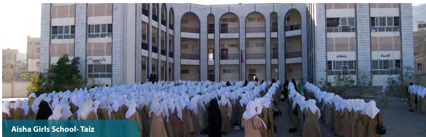
Aisha Girls School- Taiz

The SFD continued the implementation of VoLiP in Al-Hudaidah, Lahj and Sana'a Governorates. The project aims to alleviate poverty,